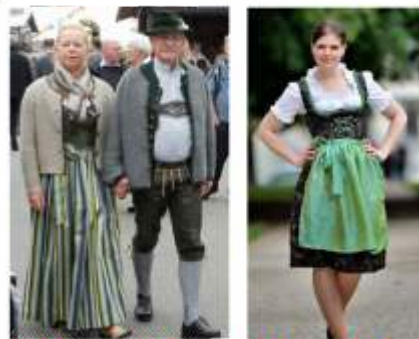
Wear your Lederhosen and Dirndl (you might need to Google them!)

Advance Tickets Required - NO Tickets at the Door Ticket Sales End October 13th